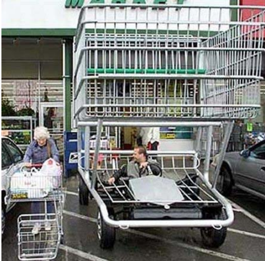
Christmas shopping – seriously! And this is a real car.