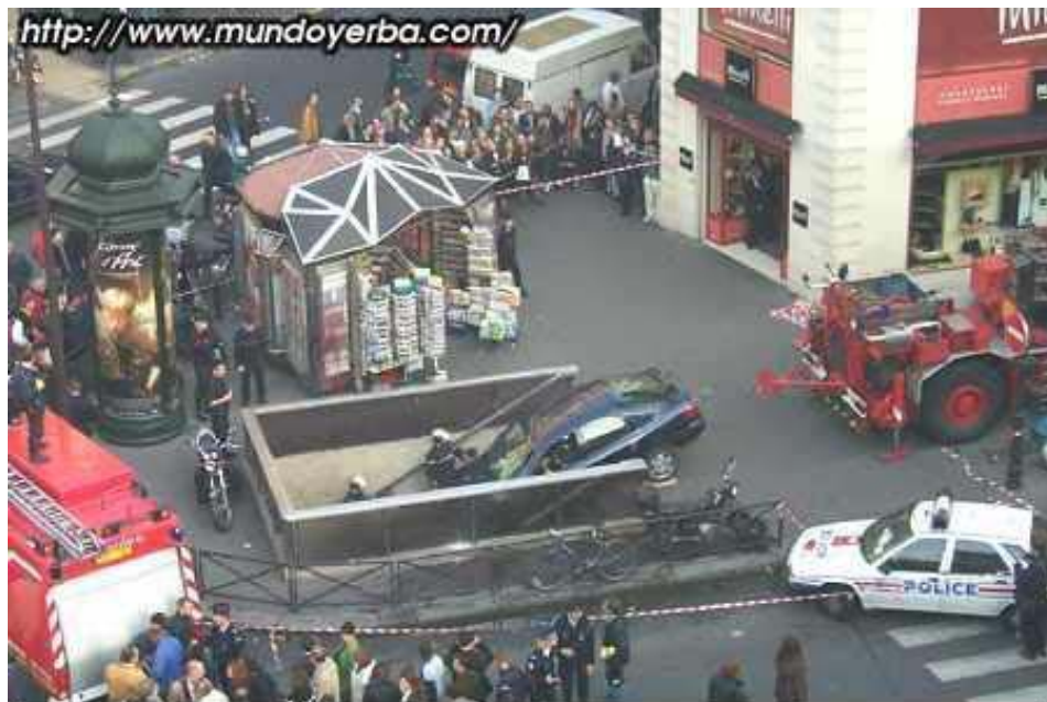
http://www.mundoyerba.com/ BOULEVARD HAUSSMAN, PARIS A WOMAN WAS CONFUSED BETWEEN THE SUBWAY AND A PARKING. VERY NORMAL. TWO HOURS LATER... THE POLICE CLEARED THE ENTRANCE

Now I think you're supposed to send this to 5 or 6, 10. Oh hell! Send it to a bunch of your friends if you can remember who they are. Then something is supposed to happen, I think. Maybe you get your memory back. Even worse, you may get mine. Did I already send this to you?