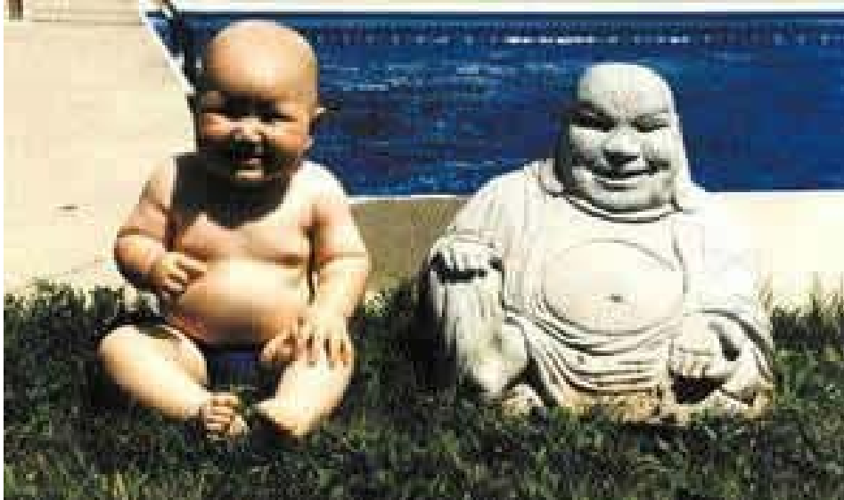
Someone said that this is your Sagacious Pixel, but which one we're not sure.

None this time. But we did get this picture. Ugh!