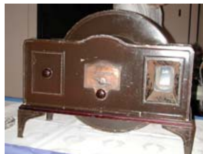
How it once was.

Most of Road Show meetings have been in association with local SBE Chapters and in some instances with the local SMPTE Section. IEEE is supposed to have an area interested in Broadcasting, but we've not heard from them. If you know any of these folks locally or otherwise, help us stir the pot. Have them contact us. There is the distinct possibility that we could add them to our list of members.