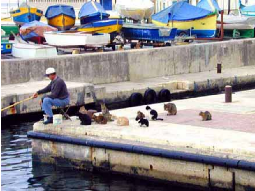
Waiting for dinner?