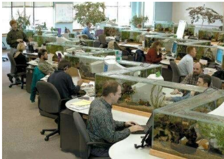
It's either the most tranquil office environment in the world or sushi on the hoof.