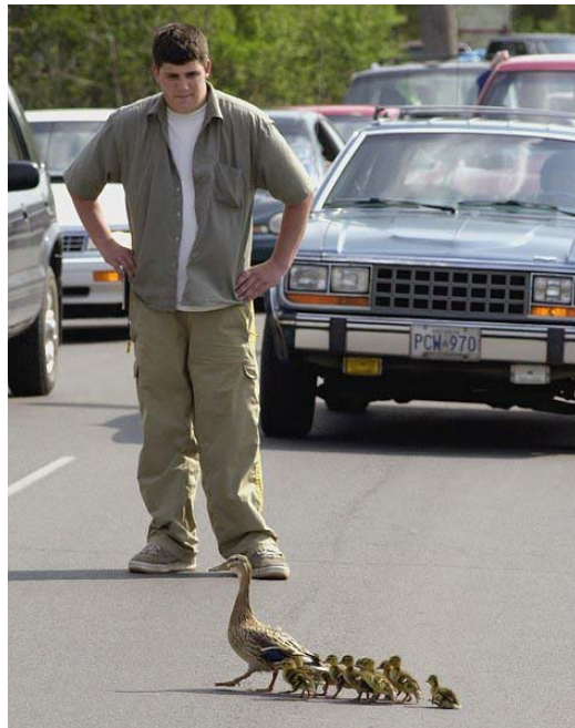
A Traffic guard's responsibilities cover many things.