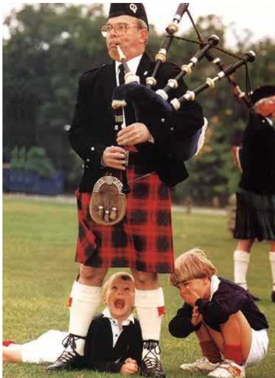
And we'll be expected to dress like this when we grow up?